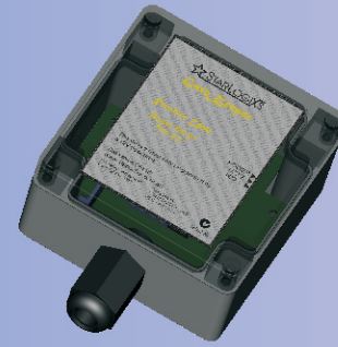
GateKeeper Receiver Unit