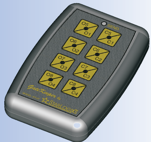
GateKeeper Remote Unit

Simply select a channel you wish to associate with the controlled device. A channel is a horizontal pair of keys, one for open and the other for close.